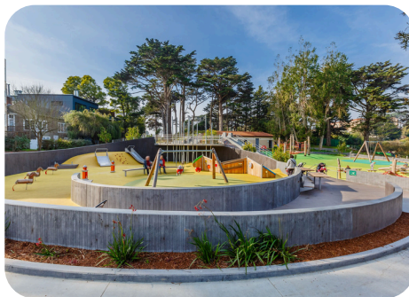
Mountain Lake Park