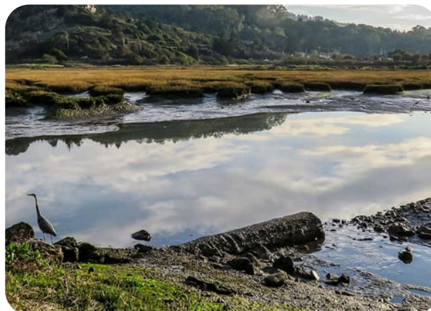
Bothin Marsh Preserve