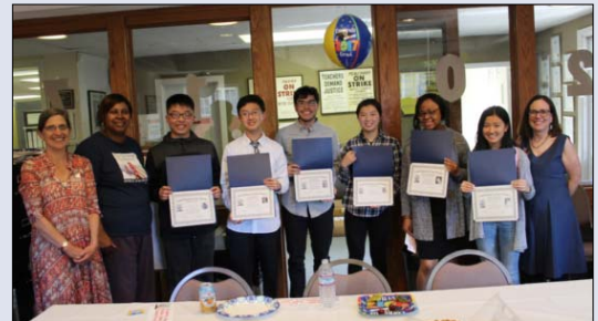
UESF scholarship winners were honored at a brief ceremony at the UESF office on May 19th.

UESF is proud to recognize the students who have been awarded the 2017 UESF scholarships. Congratulations to all of the hard-working students, we know a bright future is in store for all of you!