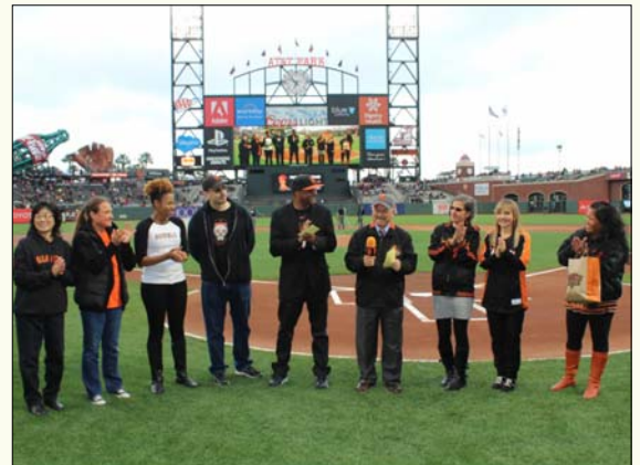
The 2016-2017 Mayor's Teachers of the Year wear honored at a pre-game ceremony at AT&T park by Mayor Ed Lee on May 11th and at a City Hall reception on May 15th.