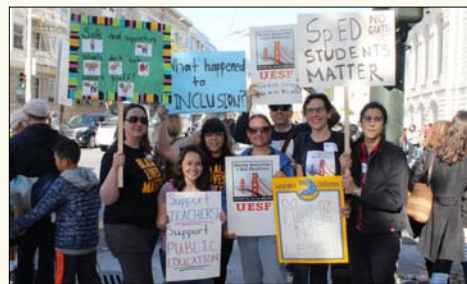
UESF members came out in force to our May 9th rally at the Board of Education when we rallied for a fair contract and to stop the cuts in Special Education. Look for more photos on UESF’s Facebook page!